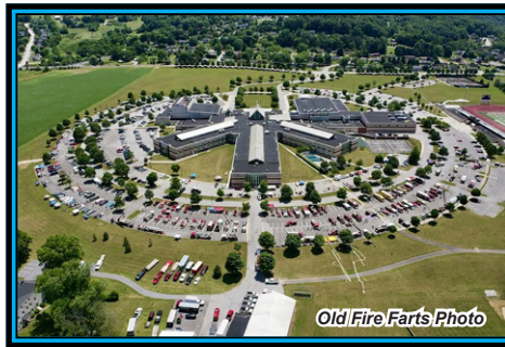
Old Fire Farts Photo