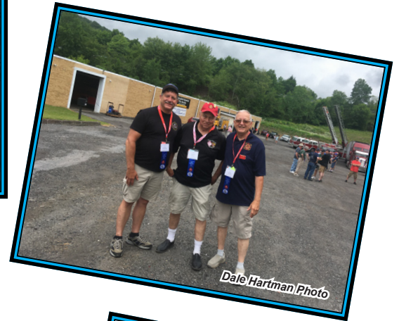
Dale Hartman Photo