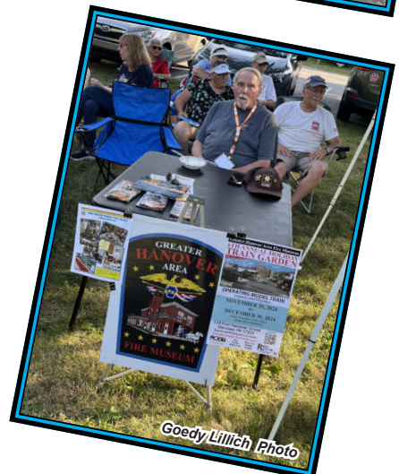
Goedy Lillich Photo