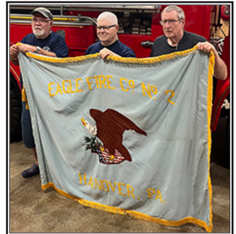
Eagle Fire Co. flag donation from the Wirt Park Fire Station.