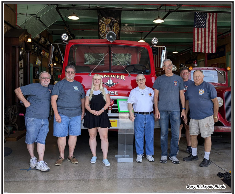
Gary Rickrode Photo

The Register Editor, Ken Buohl 190 East Walnut St, Unit 12 Hanover, PA 17331